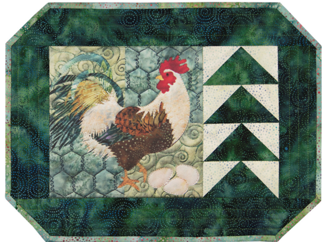
ACU09-P Proud Papa