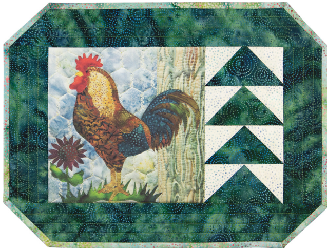
ACU05-P Dawn Patrol