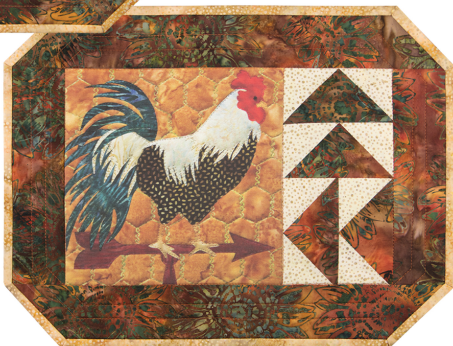
ACU07-P So Vane!