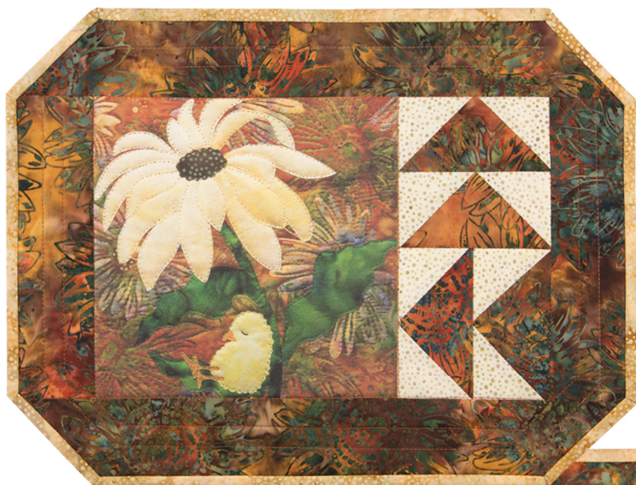
ACU06-P Tweet Dreams